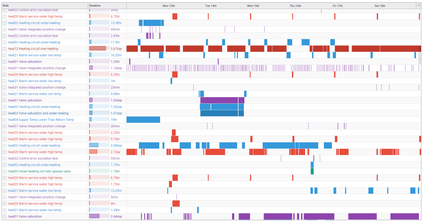
Figure 1: Overview of applied rules.

With the aim of developing energy conservation measures, the team took several actions in the winter of 2022, including: (i) monitoring heating circuits and hot water systems using SkySpark<sup>®</sup>; (ii) revising and optimizing heating