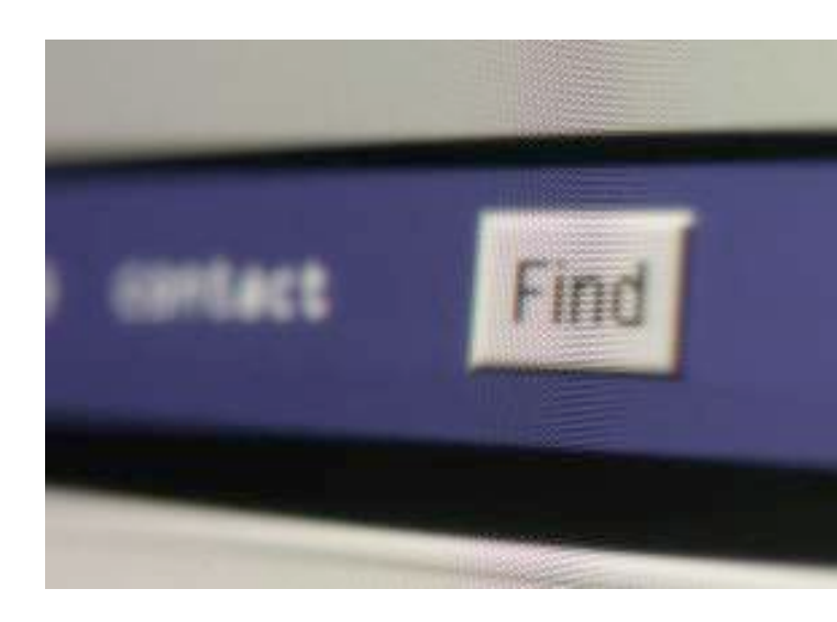
The new frontier is to efficiently manage and analyze data to find what matters™ .

Access to this data opens up new opportunities for the creation of value-added services to help businesses reduce energy consumption and cost and to identify opportunities to enhance operations through improved control, and replacement or repair of capital equipment. Access to the data is just the first step in that journey, however. The new challenge is how to manage and derive value from the exploding amount of data available from these smart and connected devices. SkyFoundry SkySpark directly addresses this challenge.